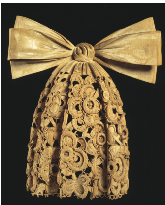
Carving, Grinling Gibbons, about 1690. Museum no. W.181:1-1928.