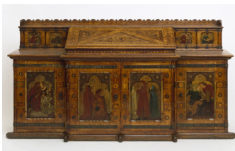
King René's Honeymoon Cabinet, 1861. Museum no. W.10:1 to 28-1927.