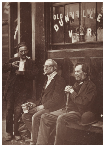
The "Wall Worker", photograph, John Thomson, 1877 - 78. Museum no. PH.332-1982.