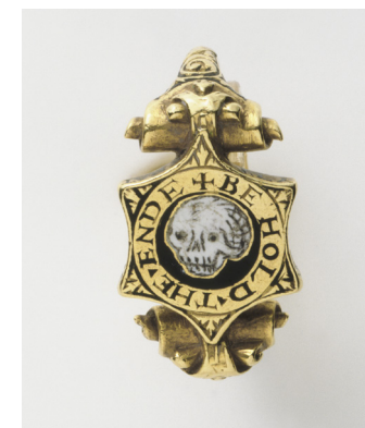
Ring, unknown maker, 1550 – 1600. Museum no. 13-1888.