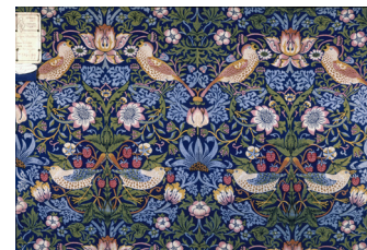
Strawberry Thief, furnishing fabric, William Morris, 1883. Museum no. T.586-1919.