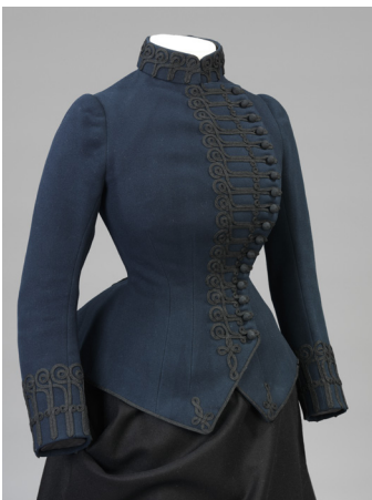
Riding habit jacket, John Redfern & Sons, 1885-1886. Museum no. T.430-1990.