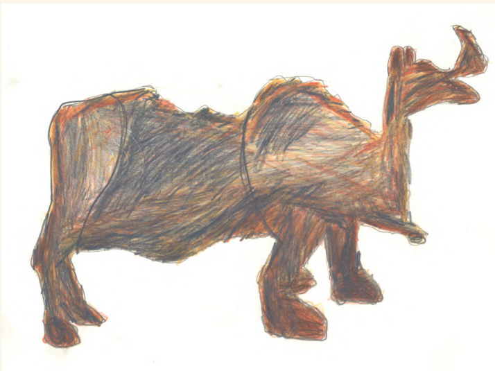
RHINOCEROS , AD 25–220, Eastern Han dynasty (Burial) 'What do you think the brown skin of the rhinoceros would feel like if you touched it?'

All images are by Christian Ovonlen and are ink and colour pencil on paper, 2014.