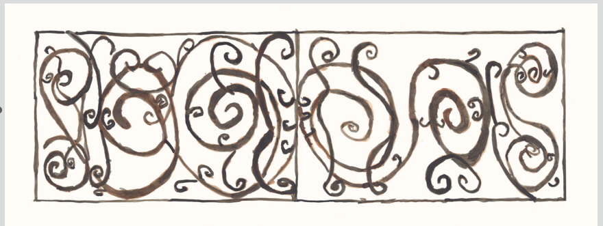
PANEL , Germany, about 1650–1700 'This panel is about 300 years older than the grille. The patterns in this panel look like a shell, and are more formal than the grille.'