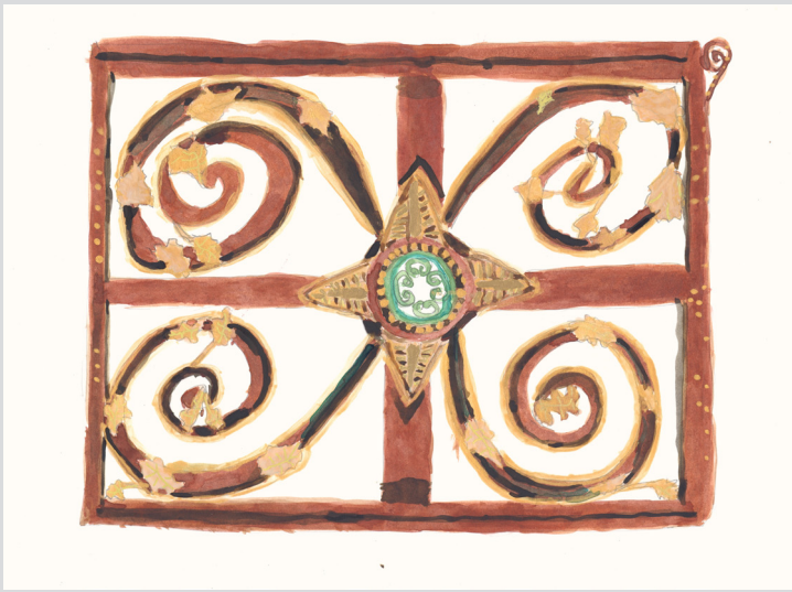
THE HERFORD SCREEN , England, 1862 'I took a detail from this screen and the scrolls with the leaves.'