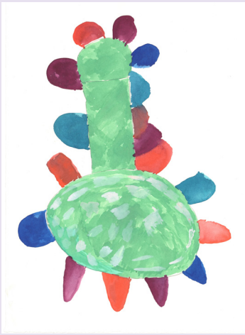
ROMAN BOTTLE , Roman Empire, 1st–3rd century (Bay 42) 'I like the round shape. How old is this bottle?'

Use this tour in conjunction with the V&A map