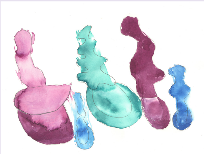
IRANIAN BOTTLES , Iran, 19th century (Case 6, Shelf 1) 'What animals do these vases remind you of?'