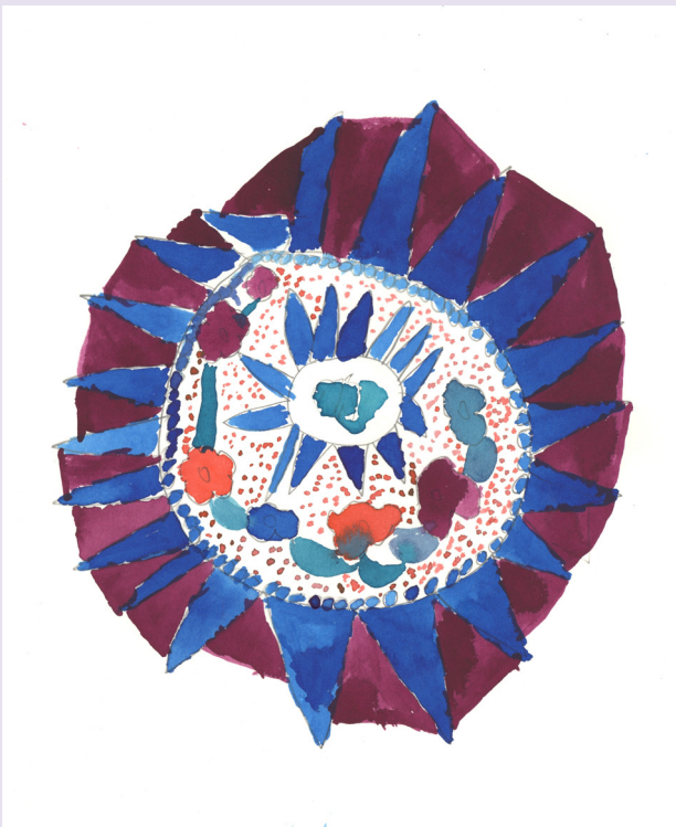
MURANO DISH , Italy, 1730 (Bay 20, Shelf 3) 'I like the Murano glass dish because it's got blue on it. How many triangles can you find?'

All images are by Selina Helene and are ink and pencil on paper, 2014.