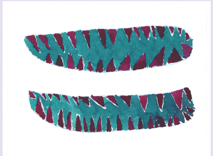
ROLLING-PIN , England, about 1855 (Bay 44) 'What would you make with a rolling-pin like this?'